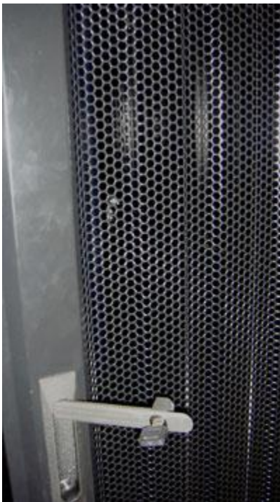
Vented Front/Back Doors